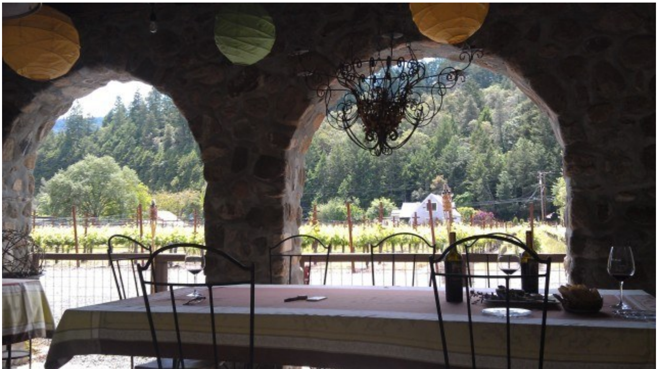
Homage Vineyard, Calistoga, Napa Valley

Jericho Canyon Vineyards: if there were only one word to describe Jericho Canyon , it would be breathtaking. Often that word is overused, but in this instance, it might actually be understating the speechless beauty visitors will encounter at this winery. Tasting suggestions: they don't make much, so try everything. Tours and seated tastings are by appointment only.