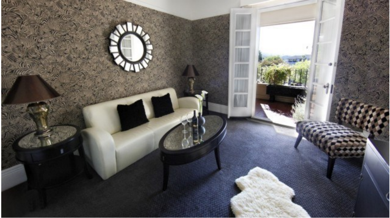
Mount View Hotel, Twomey Room, Calistoga, Napa Valley