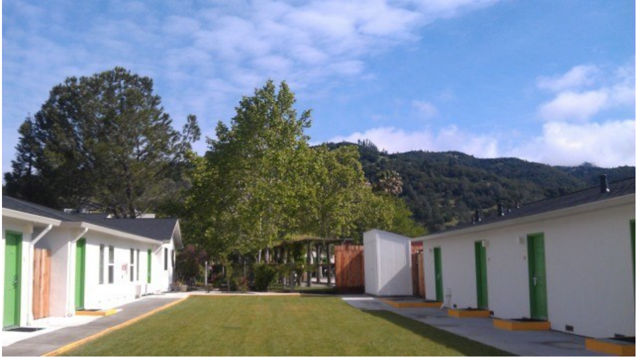
Sunburst Hotel, Calistoga, Napa Valley