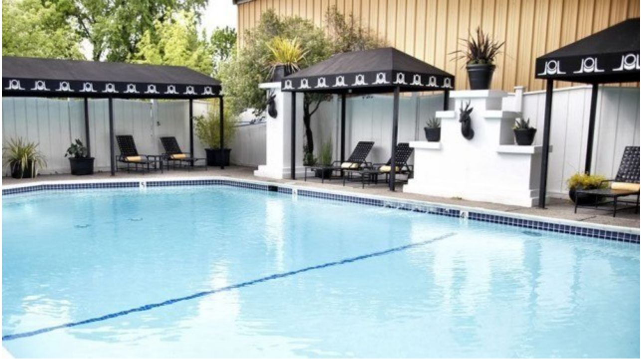
Mount View Hotel Spa Pool, Calistoga, Napa Valley