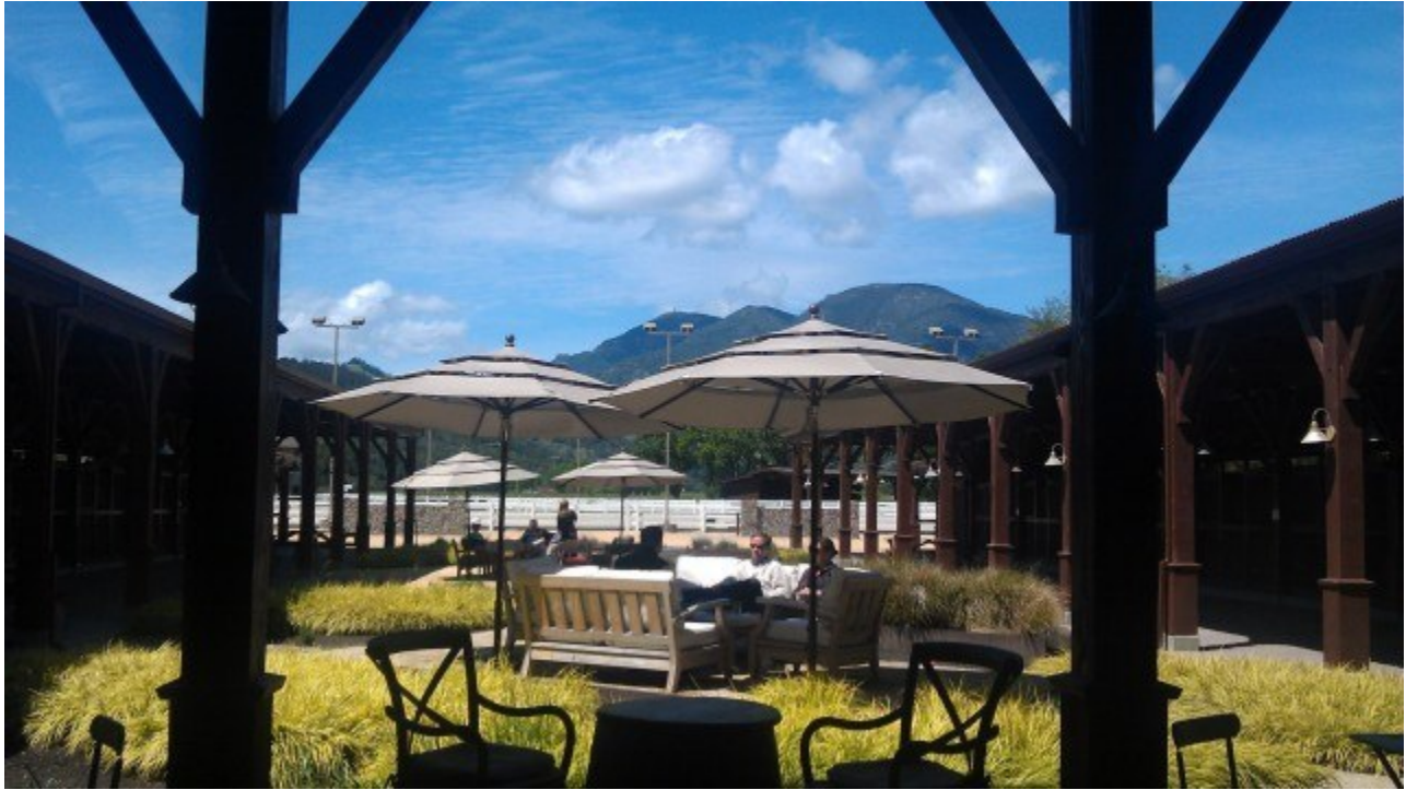
Tamber Bey Winery, Calistoga, Napa Valley

Tamber Bey: relative newcomer to the scene, Tamber Bey is a must see horse ranch and winery. At this stunning winery and horse ranch, the owners have brought their two biggest passions together. Tasting suggestions: try their Tench Sauvignon Blanc, Rabicarro Red Blend and their Oakville Estate Cab (if they are pouring it). Seated tastings are by appointment only.