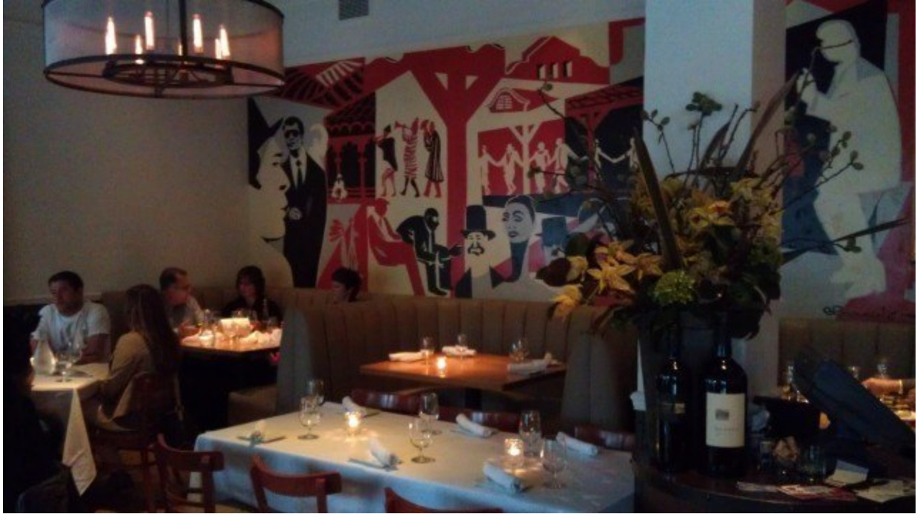
D'Amici Ristorante, Calistoga, Napa Valley

D'Amici Ristorante: D'Amici is a very urban chic, neuvo-Italian restaurant with clean, masculine architecture and incredible food. It has the look of a San Francisco restaurant tucked away on sleepy main street in Calistoga. The look, the service, the wine and the food are impeccable. Food and wine lovers, be sure not to miss this cuisine hot spot. Eating suggestions: Mozzarella tiepida, burrata con bietole, di finocchi e arance con ricotta, malfatti di bietole, gnocchi and lasagna verde al forno. Location: 1440 Lincoln Ave, 707.942.1400.